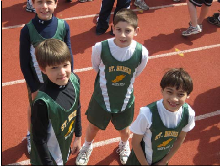
Dashing Across The Finish: Track season is underway for the Saint Brigid Track team. Here, the 4th-5th grade shuttle relay team prepares to compete in the first qualifying meet of the season.