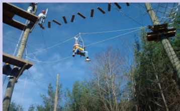
Our middle school students rise to new heights!